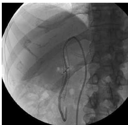
Fig. 2 A self expandable metallic stent is placed.