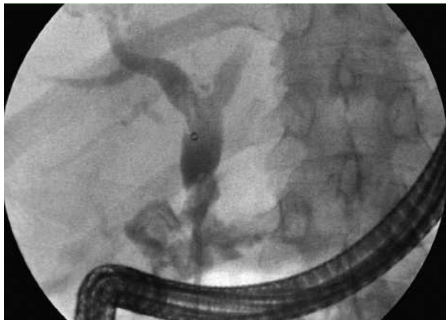
Fig. 1 A large bile leak is visualized at endoscopic retrograde cholangiopancreatography (ERCP).