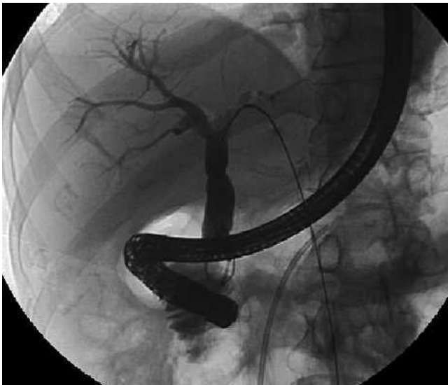
Fig. 4 Normal cholangiographic findings after stent removal.