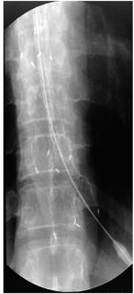
Fig. 2 Deployment of a new self-expanding metallic stent (SEMS) over the collapsed SEMS.

aspirations, re-obstruction, stent migration, tracheoesophageal fistula, late bleeding and tumor ingrowth) [1]. Collapse and fracture of an esophageal stent is a rare complication, and manifests as vomiting, dysphagia, or small bowel obstruction [2–5]. Esophageal stents, once in place and expanded, are not subject to any great mechanical stress, and corrosion is the most likely